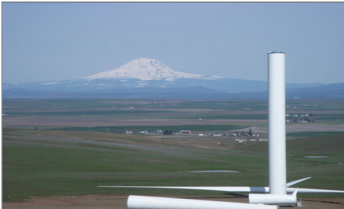
Mt Adams from what is now the operational Tuloumne Wind Project

During 2009, the WEST, Inc. Pacific Northwest office experienced a strong year with the commencement of several large baseline studies. Included in this and other projects are avian use and bat acoustic surveys, sensitive species surveys, greater sage-grouse lek and brood surveys, and raptor nest surveys. WEST, Inc. has also recently begun a long term big game study involving GPS-collared elk at an operating wind facility in Oregon. As the Pacific Northwest office continues to grow, they look forward to meeting the challenges of an increasingly diversified project portfolio.