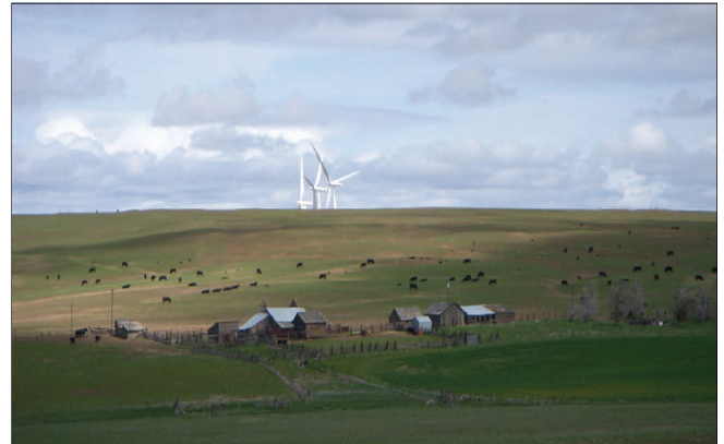
Tuloumne Wind Project, Klickitat County, Washington